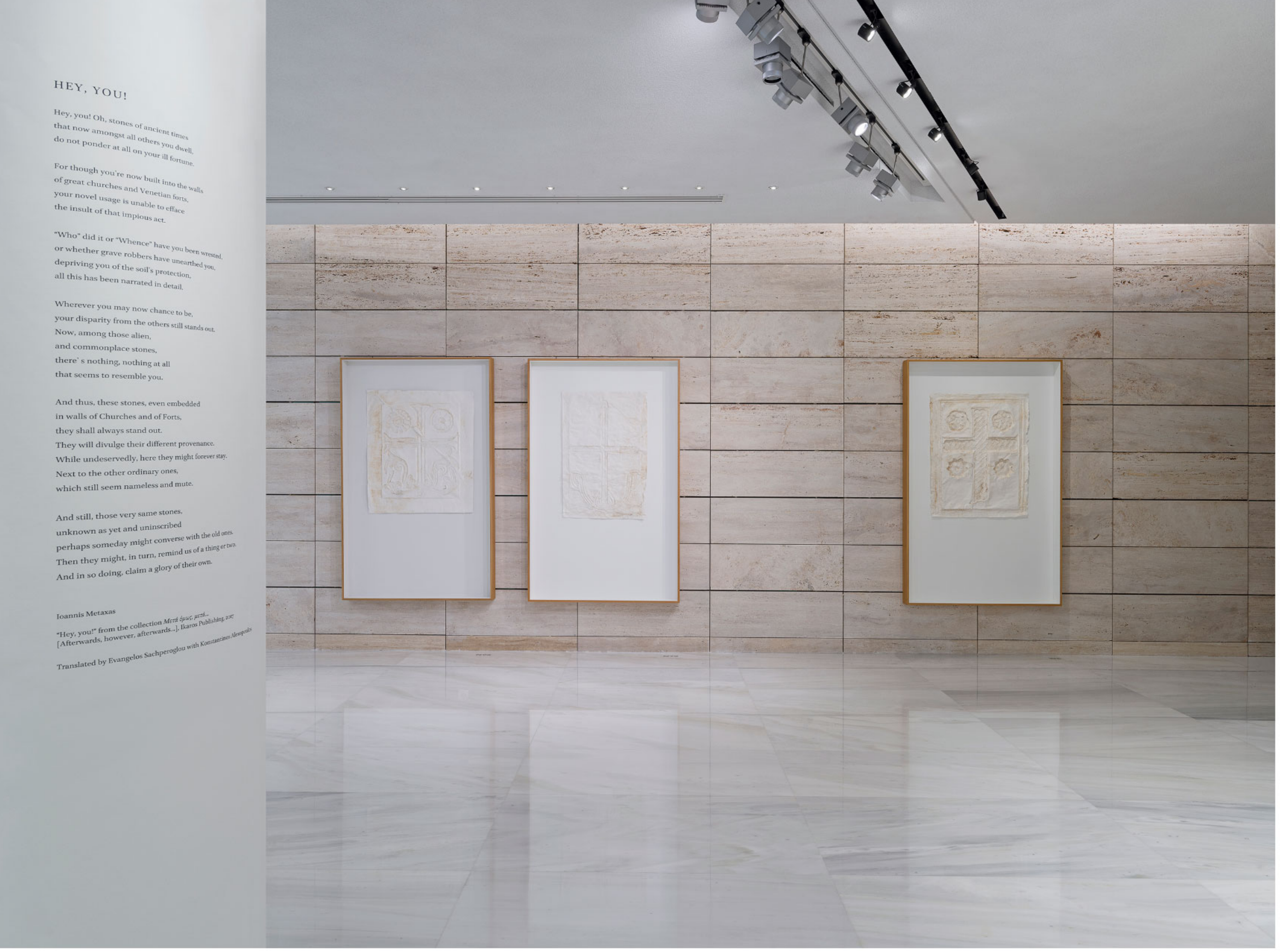
Spolia: 33 Transcripts The Gennadius Library, American School of Classical Studies Athens, Greece 10 Sept - 3 Nov 2019

She is currently research visitor in the School of Historical Studies at the Institute for Advanced Study in Princeton, where she focuses her research on the manifestations of the practice of spoliation on the city of Venice.