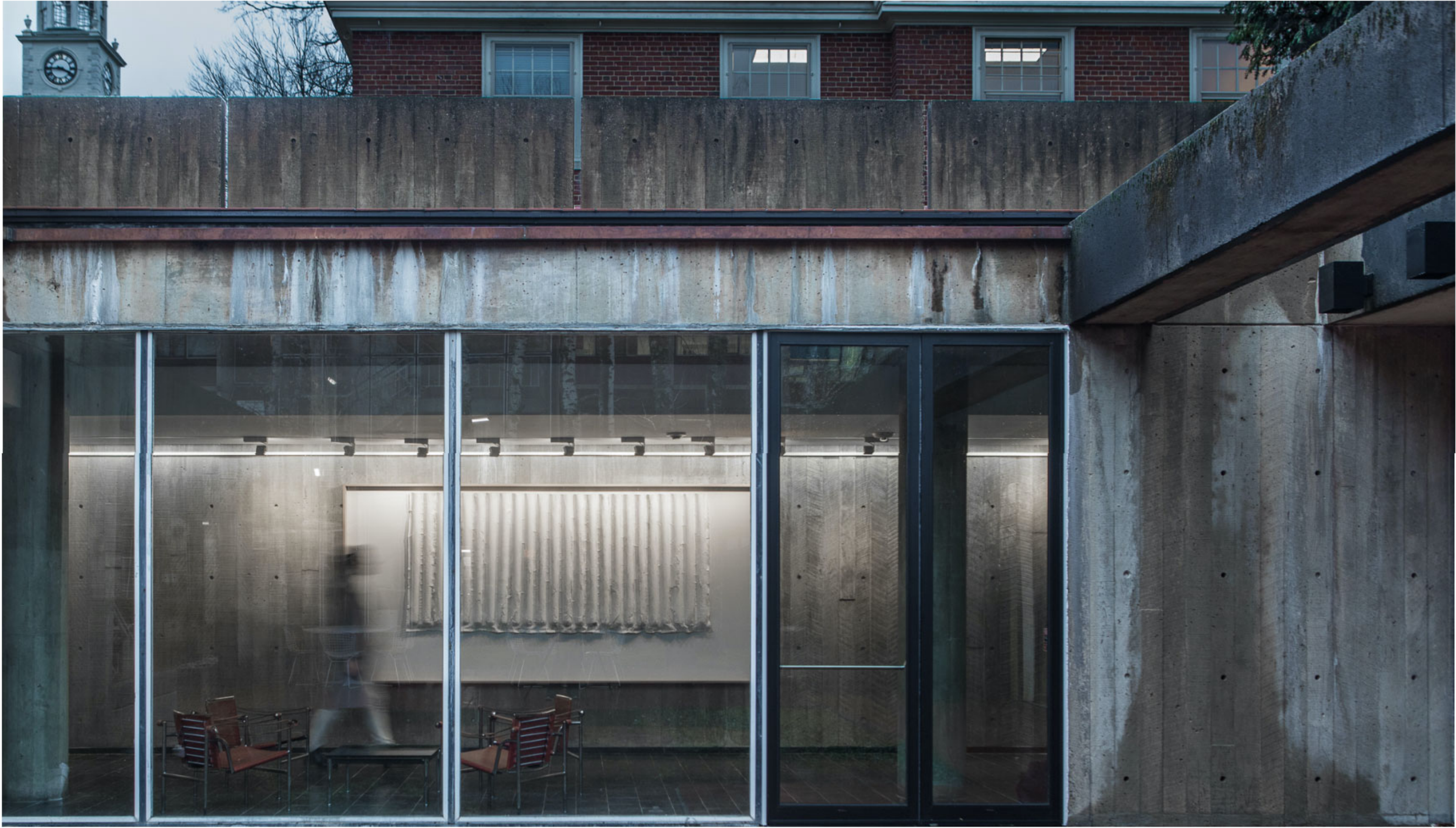
Spolia: The Ionic Colonnade Marilyn and James Simons Hall, Institute for Advanced Study Princeton, United States 21 Nov 2019 -